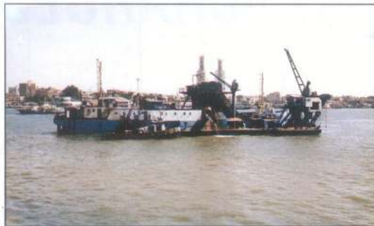
550 LIT. BUCKET DREDGER