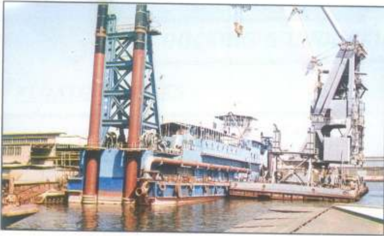
CUTTER SUCTION DREDGER