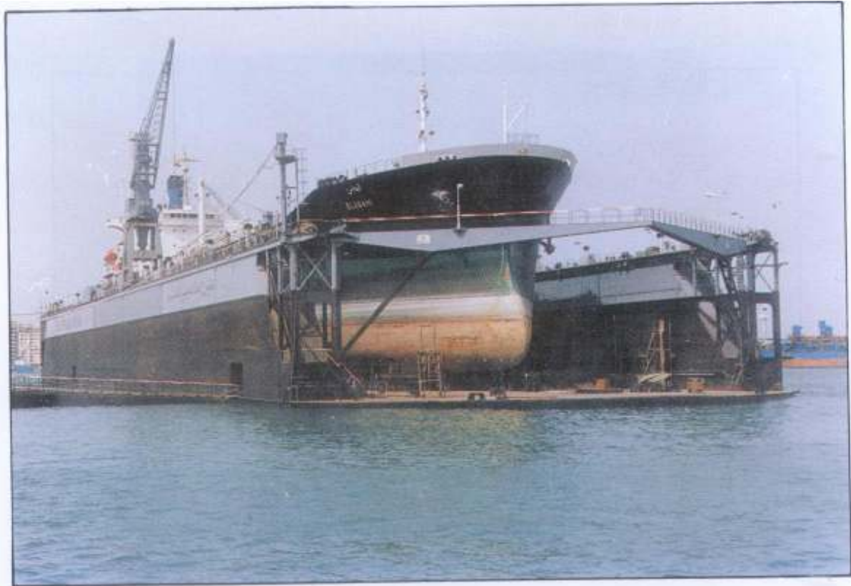
Floating Dock up to 25 000 tons Carrying Capacity