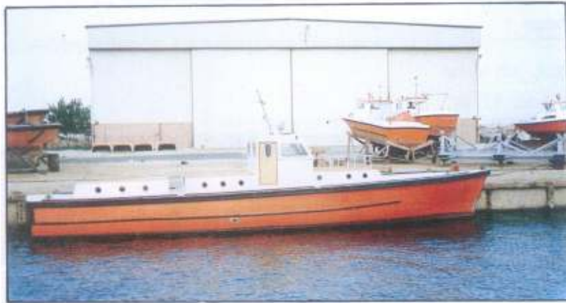
PILOT BOAT 17 M