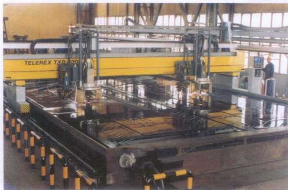
CNC plazma cutting machine

Building of different types of vessels ( ships – special purposes vessels, dredgers, tugs, ... etc ) up to 20,000 ton D.W.