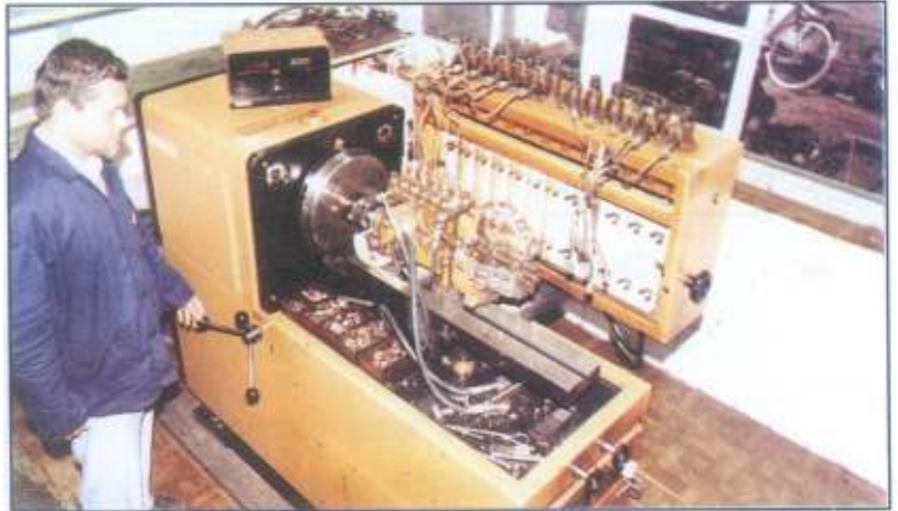
Injection pumps testing m / c