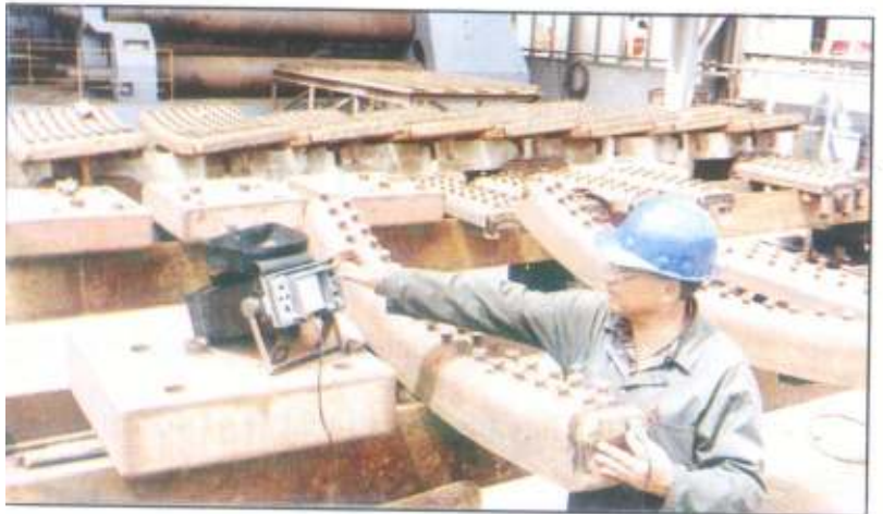
Products inspection by ultrasonic instrument