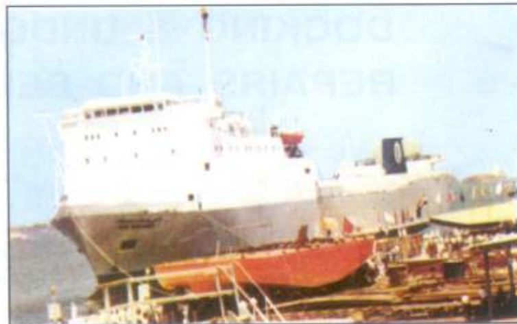
M / V RO-RO SHIP RAS MOHAMED