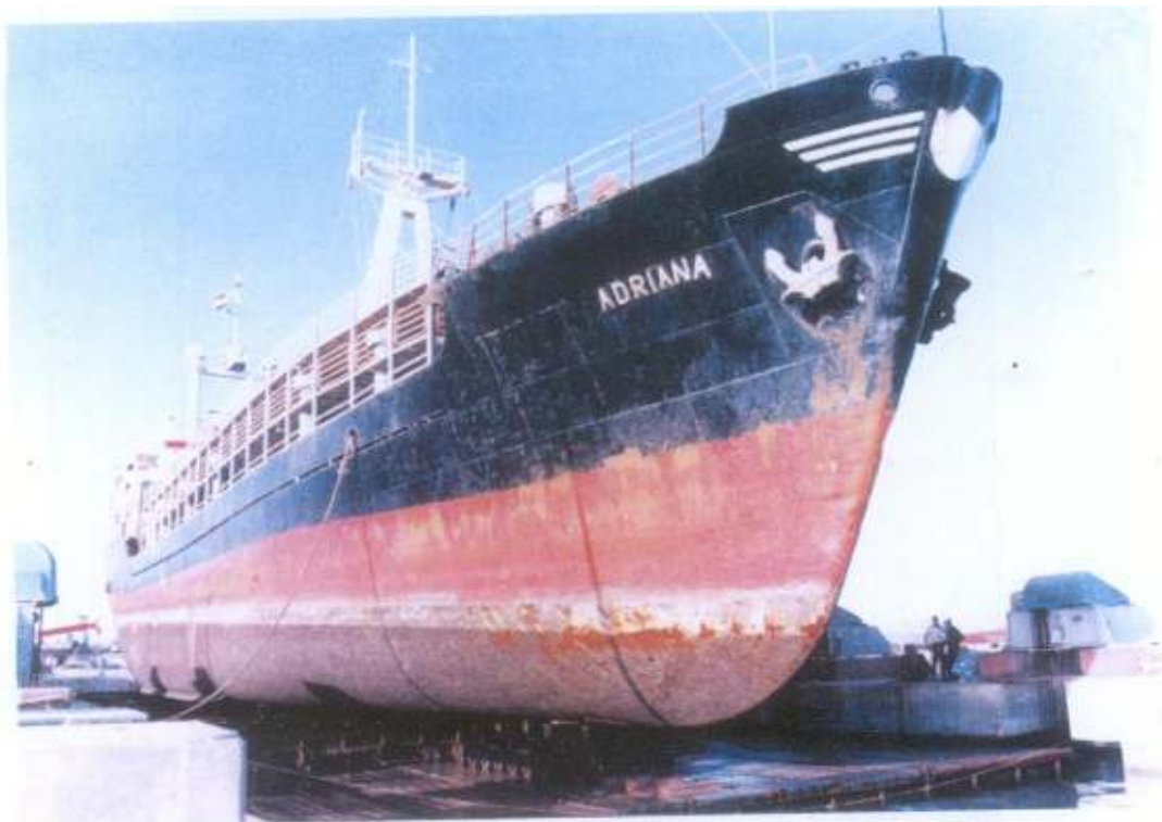
Syncrolift 2000 Ton at Port Tawfik yard