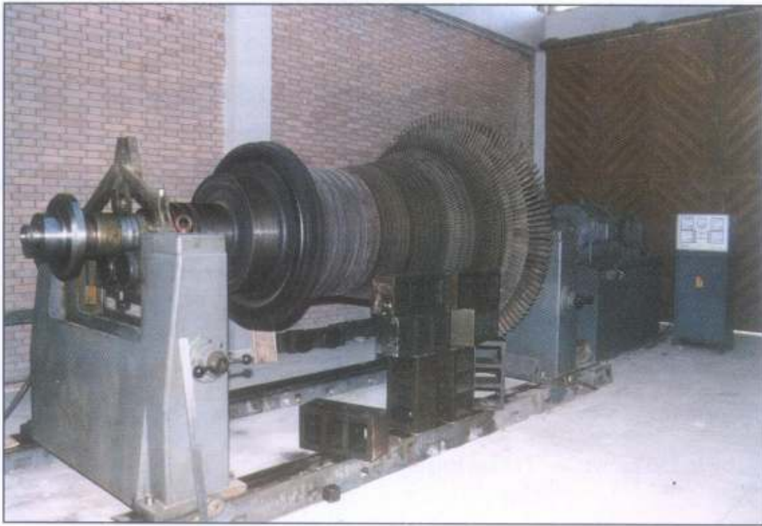
Dynamic balance machine For Jobs up to 10 ton