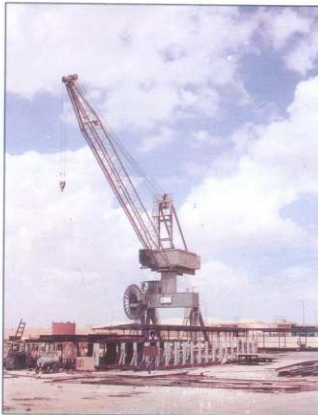
Yard Crane 10 ton/30 mt. was built in Port Said shipyard