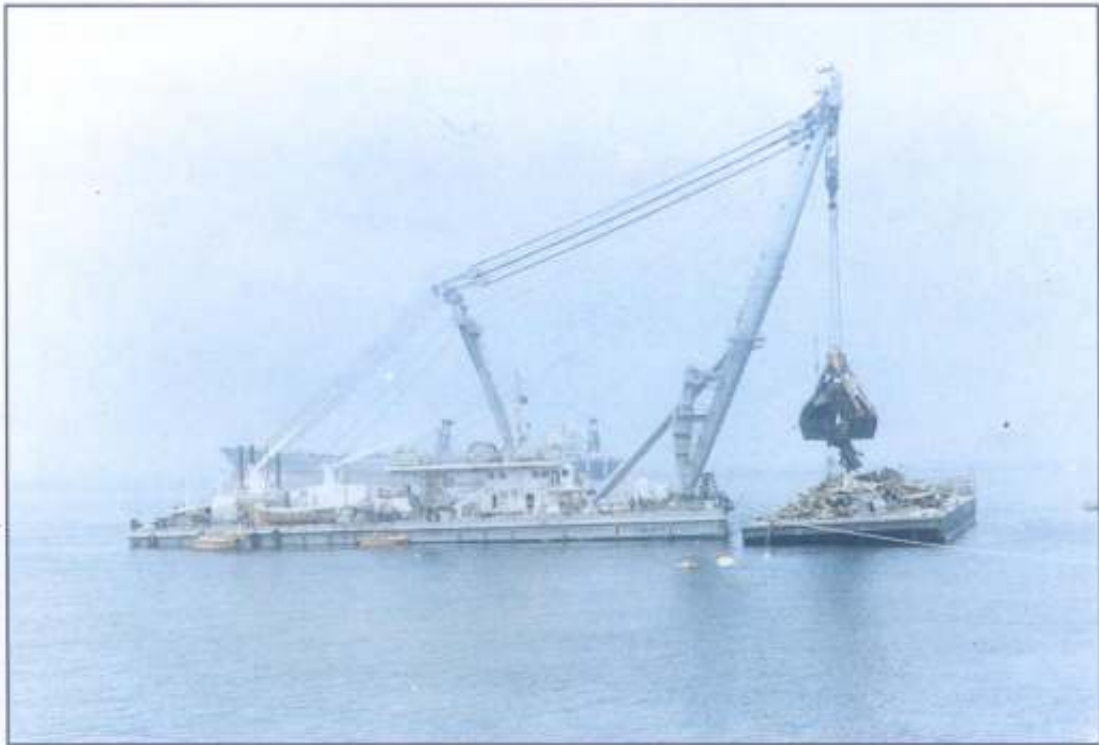
Floating cranes up to 500 t lifting capacity