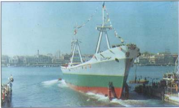
M / V SIDIE ABD EL RAHMAN 6 500 TON