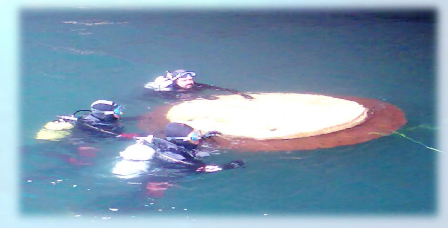
Fabricate and Welding Large Blanks for M/V Emma Maersk (Bow Thruster) 2/7/2013, Diameter (2500 Mm) one of largest container vessel in the world

Salvage section is a section of port said shipyard, which is a wellequipped repair company therefore has access to various salvage boats, tug boats, diving boats, service boats, decompression chambers and floating cranes